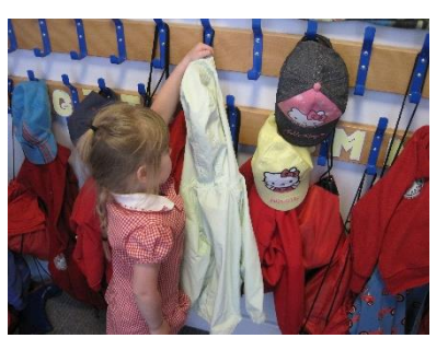
Your PE kit looks like this...