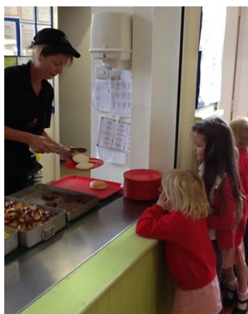
Children enjoying school dinners