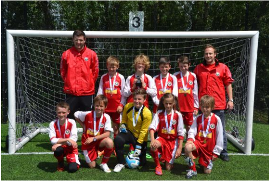
Our School Football Team

The Year 6 football team was particularly successful in 2015 reaching the national finals for small schools.