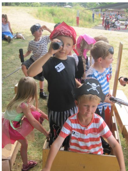
Reception children and new entrants have fun at a transition Party

Primary school places are allocated according to the Local Education Authority's agreed criteria. Details of these are available on the KCC website ( www.kent.gov.uk ) or the school website.