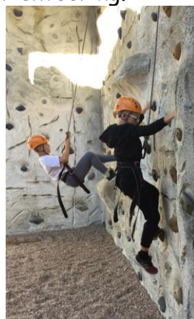
Year 6 enjoying activities at Hindleap

Part of the broader curriculum involves taking our older children on residential trips. Our Year 5 Children visit Bewl Water Outdoor Centre for 3 days of water-based activities including kayaking, canoeing & rafting. Our Year 6 children stay at Hindleap Residential Centre where they take part in a wide range of activities including abseiling, zip Lining, high Ropes activities, 'Leap of Faith' & orienteering.