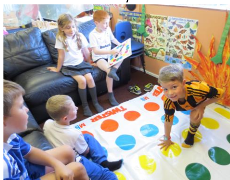
Children enjoying activities at the Late Care Club