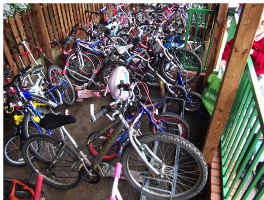
Lots of children cycle to school in the summer.

There is a public bus service that runs to and from Faversham in line with the school day.